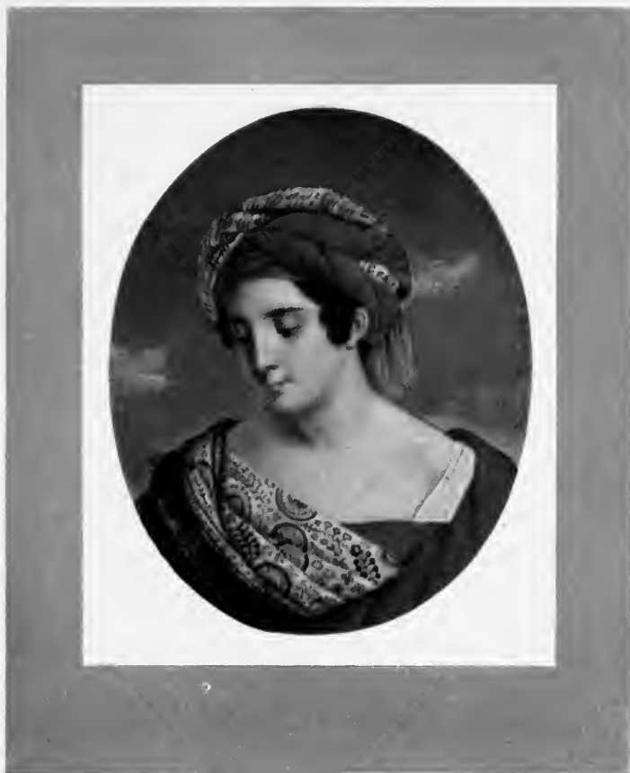
PRINCESS PAULINE BORGHESE BY B. ANGUISSOLA